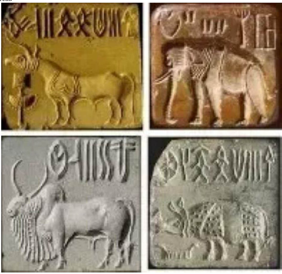
The article deals with the documental ancientness of Sindhi Language, especially with reference to proto-Dravidian languages, Dravidian languages, Vedic culture and Panani's Grammar of Sanskrit